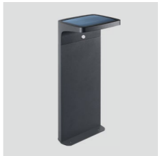
C-142S Bollard Lighting: 2.5W / 0.1W. Page. 388