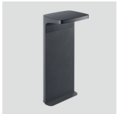
C-142 Bollard Lighting: 12W. Page. 388