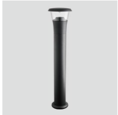
C-190R Bollard Lighting: 12W. Page. 374