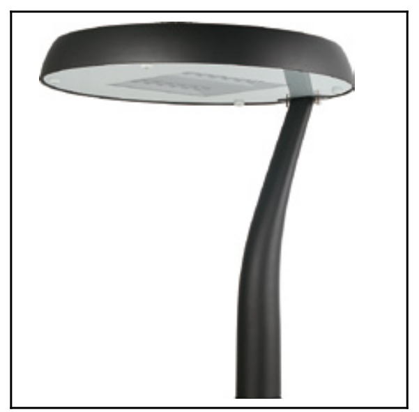
The photograph may not match the reference exactly. Please read the product description to identify the finish.