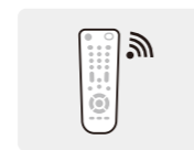
遥控器 Remote control