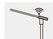
节能控制系统 Energy saving with remote control system