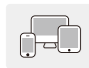
物联网智能系统 Network for smart intelligent system