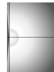
Light emission 180°