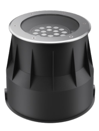
M-02 25W / 40W